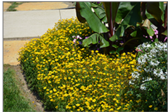
Goldilocks Rocks Bidens in bloom