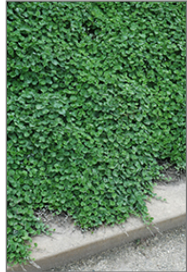
Emerald Falls Dichondra