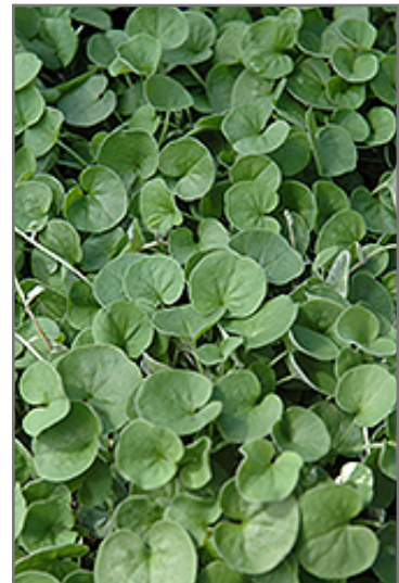
Emerald Falls Dichondra foliage