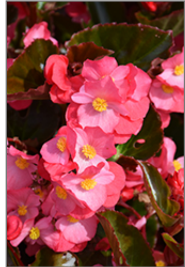
Big Rose Bronze Leaf Begonia flowers

This is a high maintenance plant that will require regular care and upkeep, and usually looks its best without pruning, although it will tolerate pruning. Deer don't particularly care for this plant and will usually leave it alone in favor of tastier treats. Gardeners should be aware of the following characteristic(s) that may warrant special consideration;