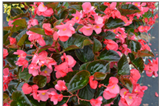
Big Rose Bronze Leaf Begonia flowers