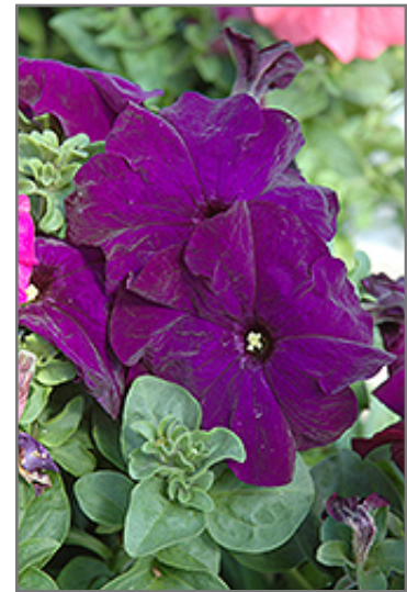
Dreams Midnight Petunia flowers