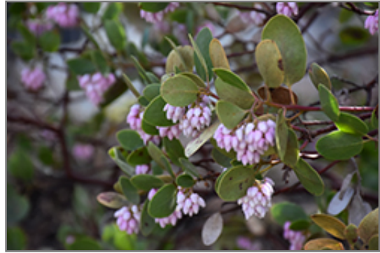
Common Manzanita flowers

This shrub does best in full sun to partial shade. It is very adaptable to both dry and moist growing conditions, but will not tolerate any standing water. It is very fussy about its soil conditions and must have sandy, acidic soils to ensure success, and is subject to chlorosis (yellowing) of the foliage in alkaline soils, and is able to handle environmental salt. It is somewhat tolerant of urban pollution. This species is native to parts of North America.