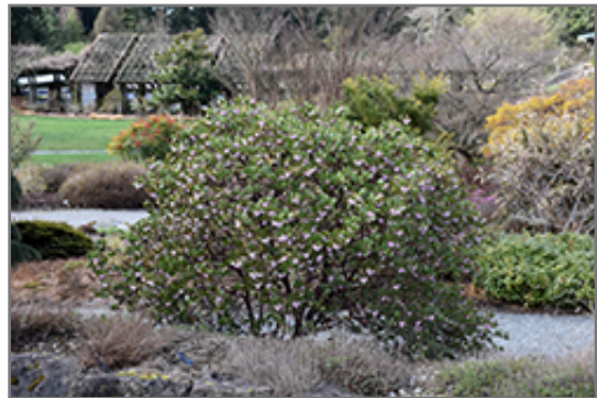
Common Manzanita in bloom