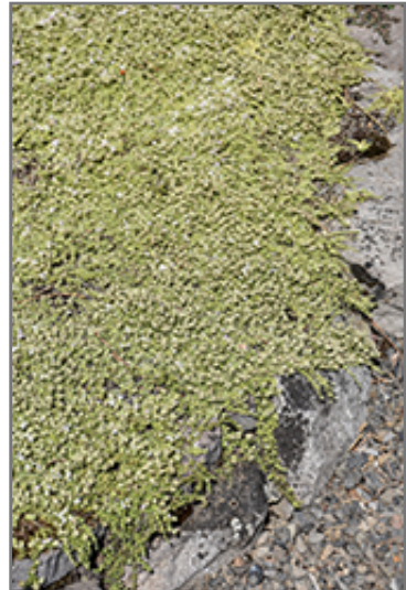
Highland Cream Creeping Thyme