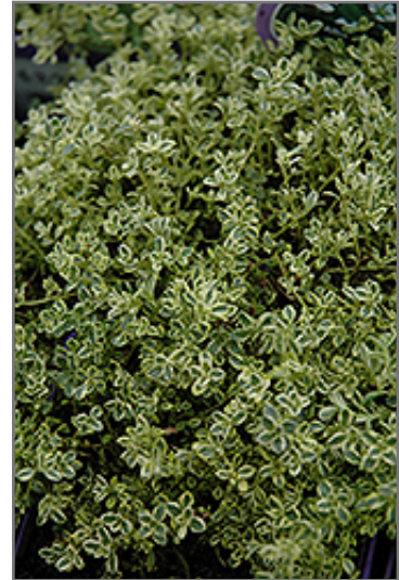
Highland Cream Creeping Thyme

Highland Cream Creeping Thyme is recommended for the following landscape applications;