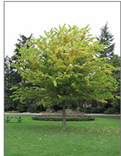
Common Hackberry in fall