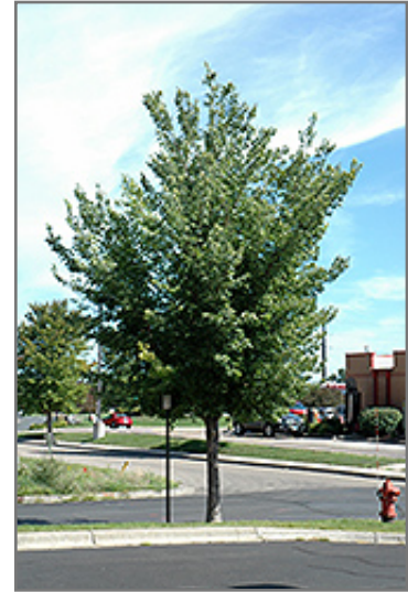
Common Hackberry