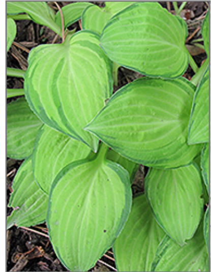
Emerald Tiara Hosta foliage

Emerald Tiara Hosta is recommended for the following landscape applications;