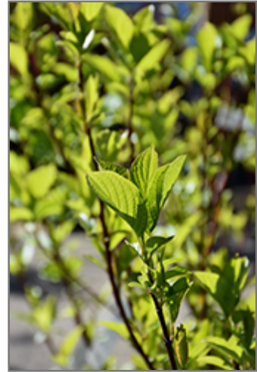
Bailey Red-Twig Dogwood foliage

This shrub does best in full sun to partial shade. It is an amazingly adaptable plant, tolerating both dry conditions and even some standing water. It is not particular as to soil type or pH. It is highly tolerant of urban pollution and will even thrive in inner city environments. This species is native to parts of North America.