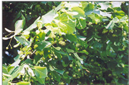
Littleleaf Linden flowers