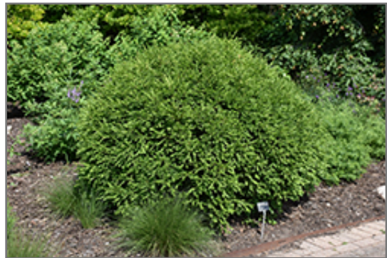
Green Gem Boxwood