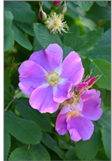
Wild Rose flowers

Wild Rose is recommended for the following landscape applications;