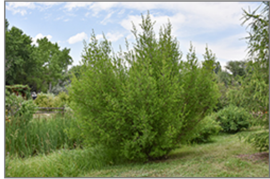
New Mexico Privet