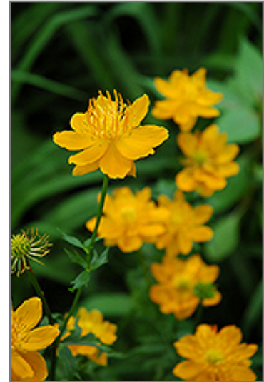
Globeflower flowers

Globeflower has masses of beautiful gold buttercup flowers with orange anthers at the ends of the stems from late spring to early summer, which are most effective when planted in groupings. The flowers are excellent for cutting. Its deeply cut lobed leaves remain dark green in color throughout the season.