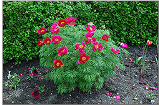
Fernleaf Peony in bloom