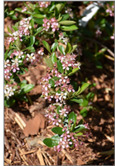
Ground Hug Aronia flowers