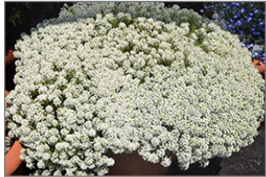
Snow Globe Alyssum in bloom