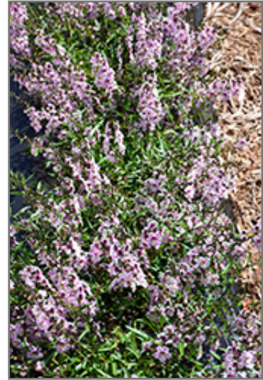
Pinstripe Vintage Pink Angelonia in bloom

Pinstripe Vintage Pink Angelonia is a fine choice for the garden, but it is also a good selection for planting in outdoor containers and hanging baskets. It is often used as a 'filler' in the 'spiller-thriller-filler' container combination, providing a mass of flowers against which the larger thriller plants stand out. Note that when growing plants in outdoor containers and baskets, they may require more frequent waterings than they would in the yard or garden.