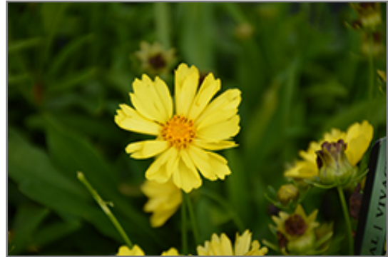
Leading Lady Sophia Tickseed flowers

Leading Lady Sophia Tickseed is recommended for the following landscape applications;