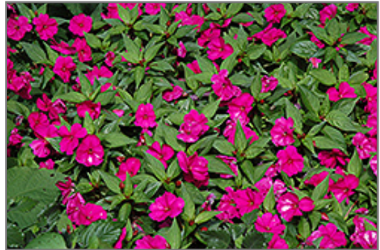
Big Bounce Violet Impatiens in bloom