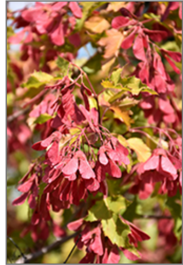
Amur Maple (tree form) fruit

This tree does best in full sun to partial shade. It is very adaptable to both dry and moist locations, and should do just fine under average home landscape conditions. It is not particular as to soil type or pH. It is highly tolerant of urban pollution and will even thrive in inner city environments. This is a selected variety of a species not originally from North America.