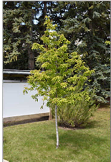
Amur Maple (tree form)