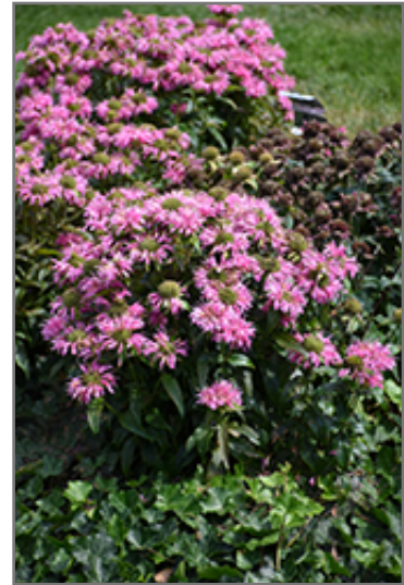
Pardon My Pink Beebalm in bloom