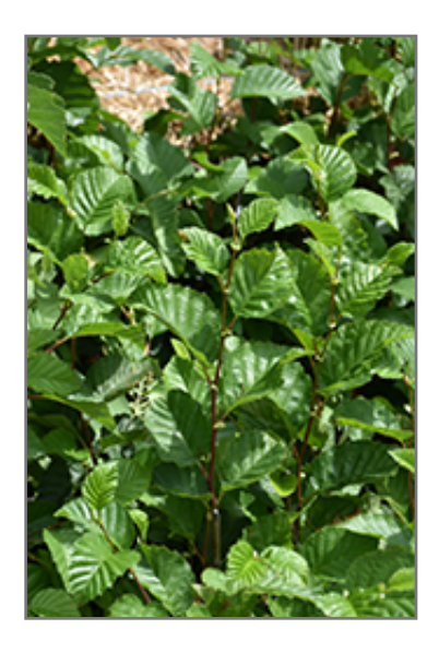
Mountain Alder foliage

400 Gillespie Drive El Jebel, Colorado, 81623 (970) 963 1173 www.eaglecrestnursery.com