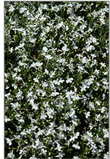
Techno Upright White Lobelia flowers