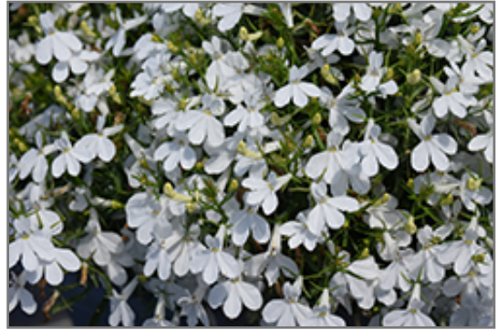
Techno Upright White Lobelia flowers

Techno Upright White Lobelia is recommended for the following landscape applications;