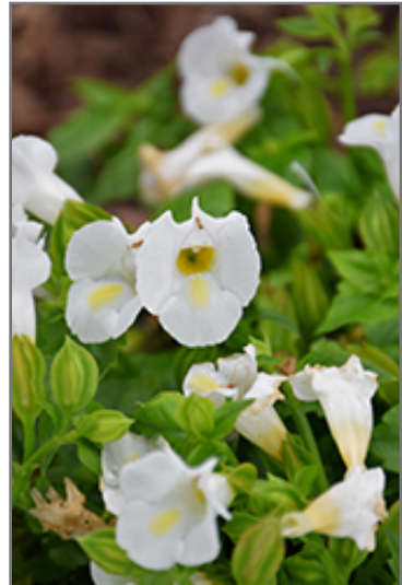
Catalina White Linen Torenia flowers