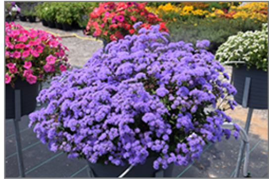
Artist Blue Flossflower in bloom